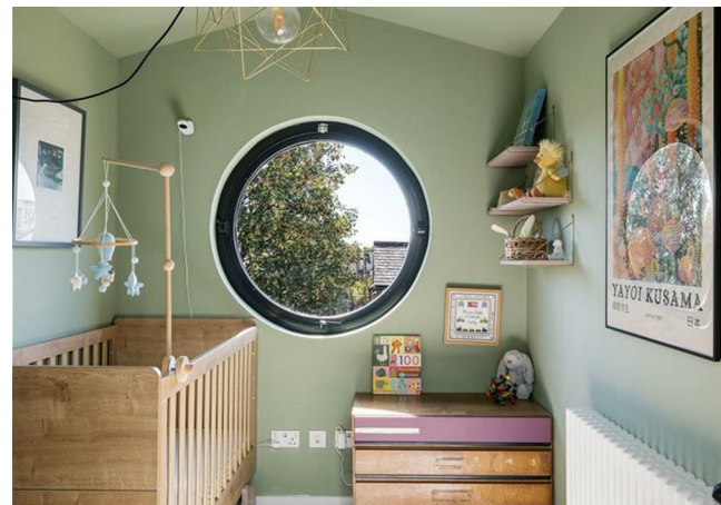
Reception Room 10'4" x 10'11"